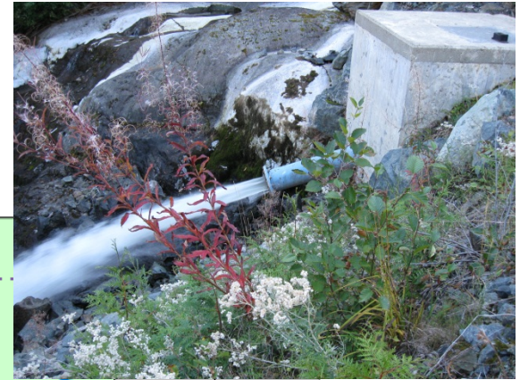
2012 Arrowsmith Dam Lake Levels - Provisional Operating Rule Curve