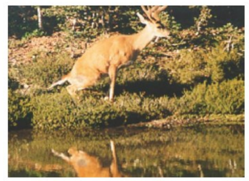
Even the most pristine of water sources can become contaminated.